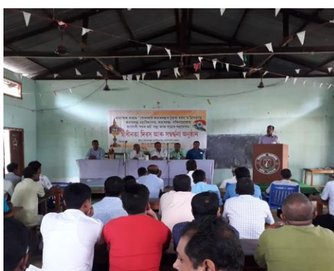
Independence day celebration