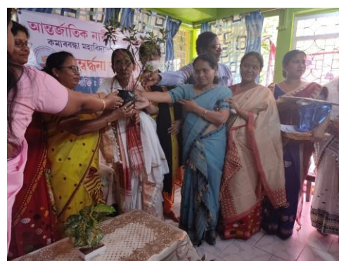
Women's day celebration