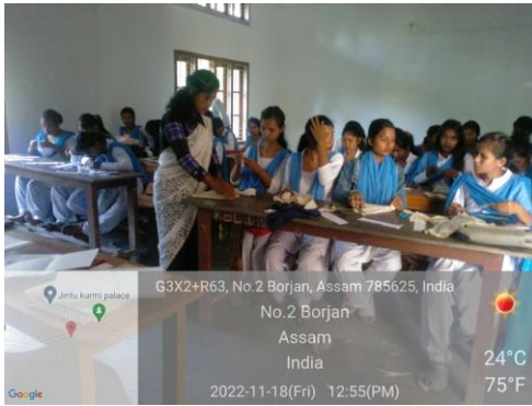
Cutting & embroidery