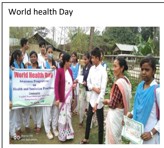
World health Day