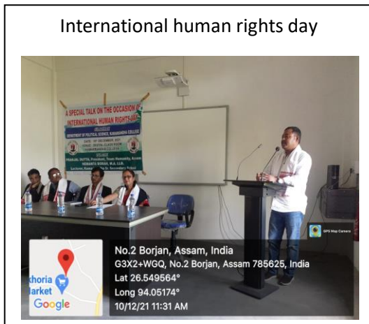
International human rights day