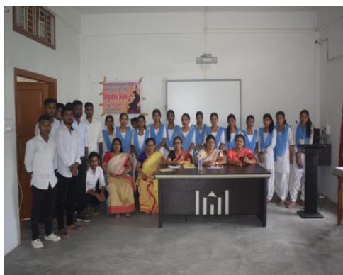
Bishnu rabha divas