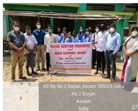
Socio economic survey