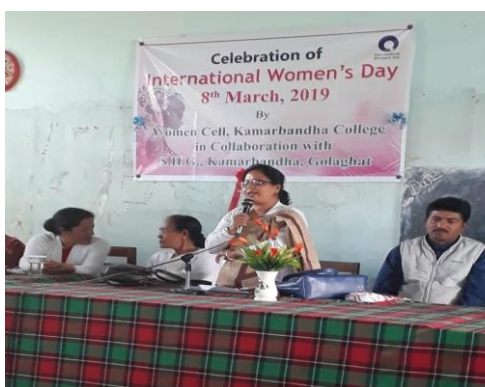
Women's day with SHG