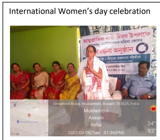
International Women's day celebration