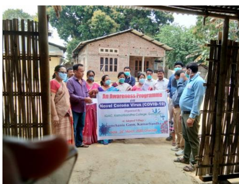
Corona awareness in adopted village